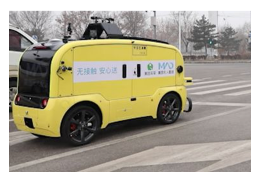
"Magic Bag" of Meituan

distribution functions also greatly improved distribution efficiency. Apart from promoting the resumption of production and work vigorously, it is also very important for the long-term development of the company themselves.