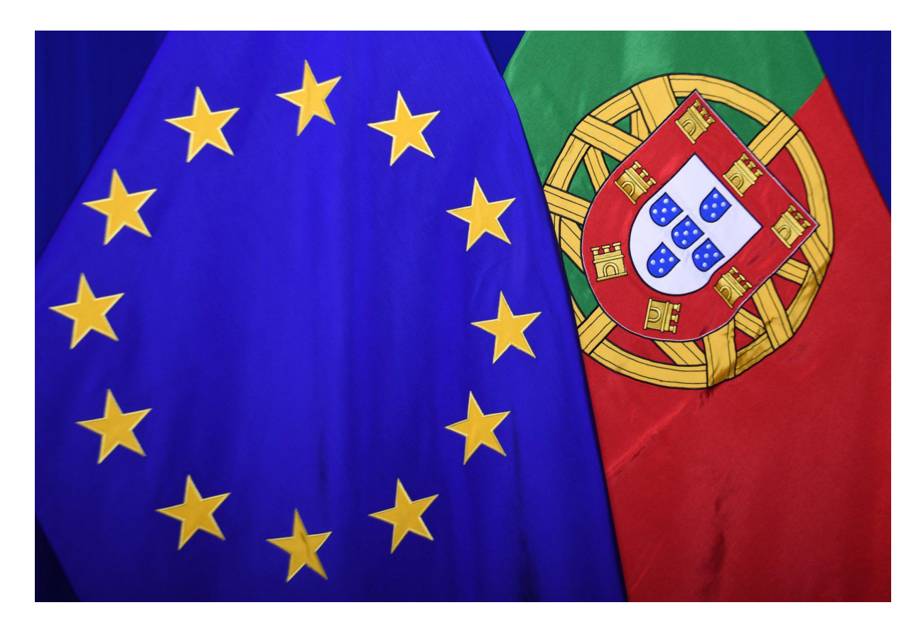
Figure 1:

The nation of Portugal is amongst Europe's oldest, and the country's historical influence and reach has been tremendous. Although the decline and loss it experienced over the years has diminished its prestige, it has nonetheless retained a strong soft power capability - akin to other European former colonial powers. As a historically far-reaching nation, and one with a large emigrant population, it has an extensive network of embassies and consulates throughout the world. It is most certainly a country "punching far above its weight" in terms of soft-power and diplomatic effort - and one doing so with a very limited budget.