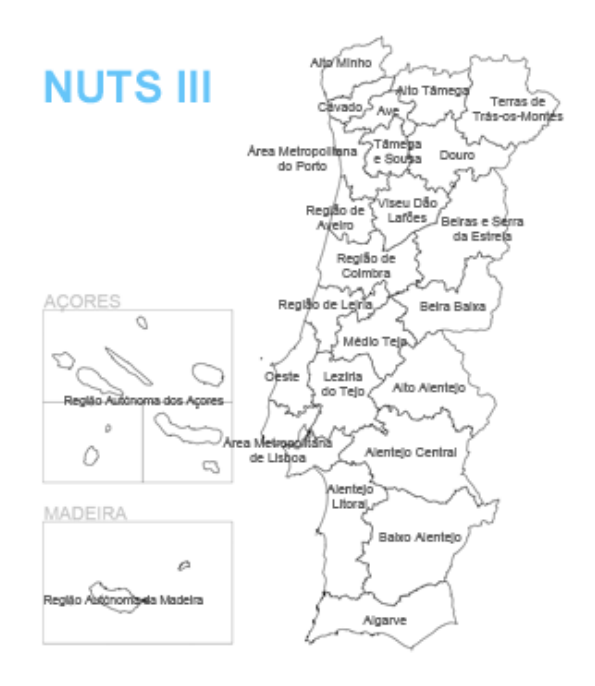
Figure 4: Portugal map divided into NUTS III,