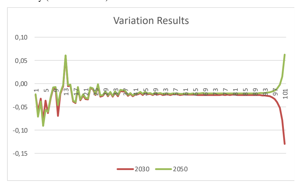
Figure 5: Variation of mortality rates for 2030 and 2050

ages 0 to 5. Additionally, in the oldest age group a divergent behavior is noticeable between the two years in our study (2030 and 2050).