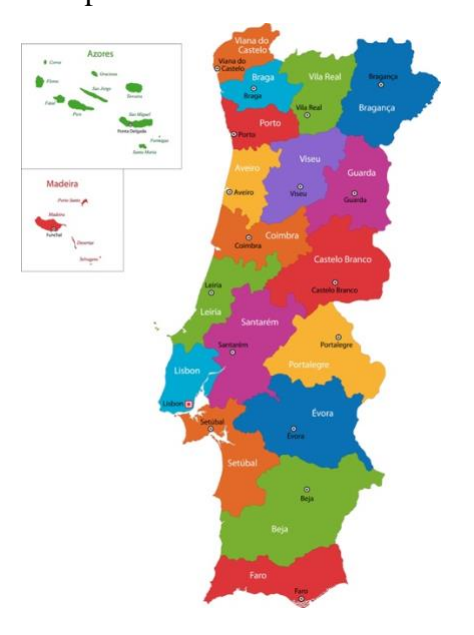
Figure 3: Portugal map divided into districts,

The approach chosen to obtain the mortality shock at the whole country level was to calculate a population weighted shock, using Eurostat most recent data on demographics, that is, using their 5-year age groups data at NUTS III level, from January 1<sup>st</sup> of 2022 (Eurostat, 2023). The NUTS (Nomenclature of territorial units for statistics) are a three-tiered hierarchical classification system, where NUTS III is a more granular level divided in small regions. In fact, more granular that the district level presented in Table 5 with the temperature climate results.