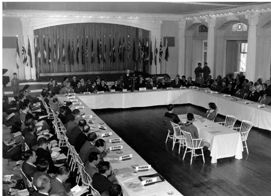
Bhutan has measured citizens' well-being using gross national happiness since 2008 (left); GDP has been in use since the 1944 Bretton Woods meeting (right).

of the 2012 Rio+20 UN Conference on Sustainable Development agreed to by all UN member states.