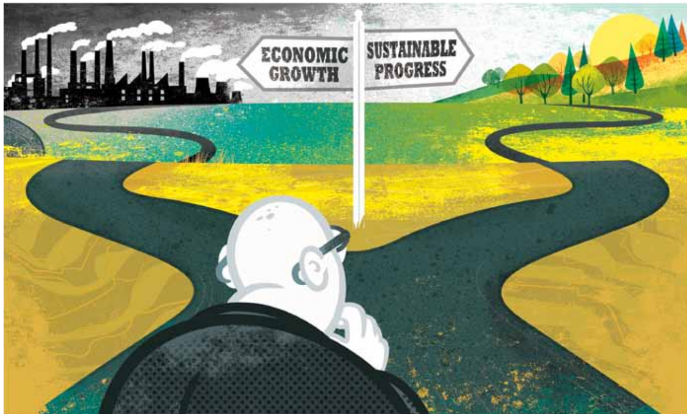
ILLUSTRATION BY PETE ELLIS/DRAWGOOD.COM

FUNDING Grant applications should feature multimedia presentations p.291